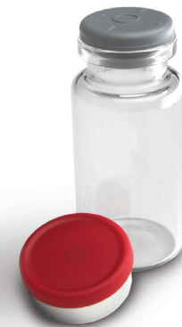
The West Ready Pack® system includes Westar ready-to-use stoppers.

Our testing and validation work can help improve the speed of product development and manufacturing.