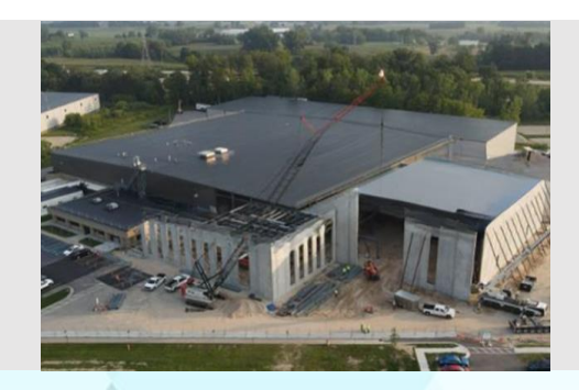
Contract Manufacturing Expansion at Grand Rapids, Michigan