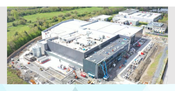
Global Capacity Expansion