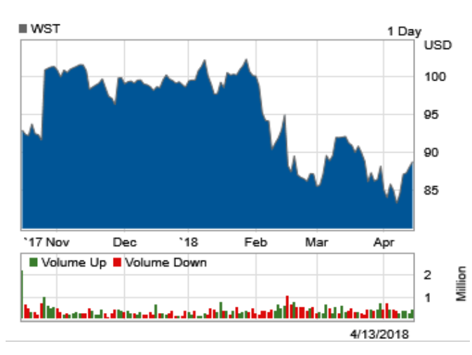
Data provided by Nasdaq. Minimum 15 minutes delayed.