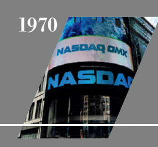
West Company Goes Public